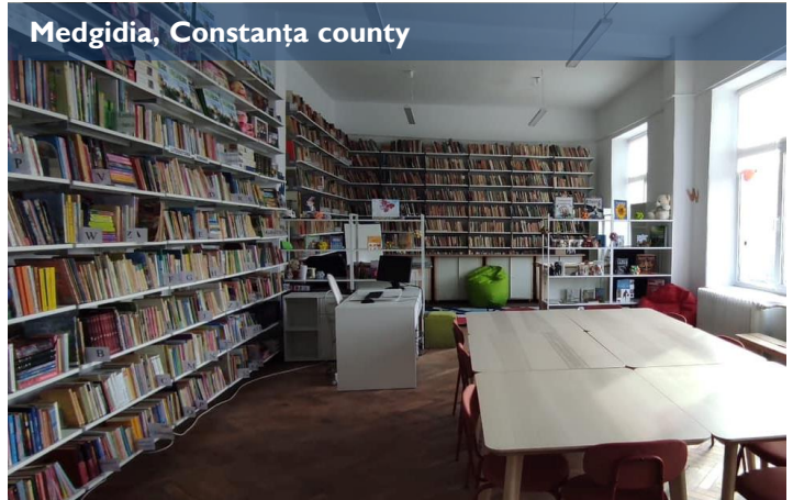
Medgidia, Constanța county