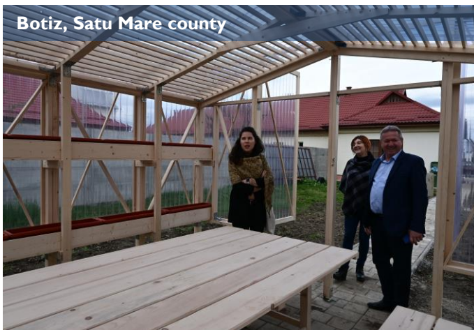
Botiz, Satu Mare county