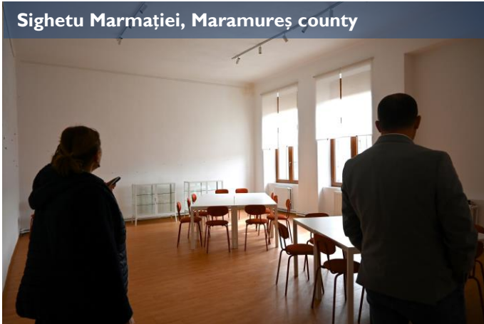
Sighetu Marmației, Maramureș county