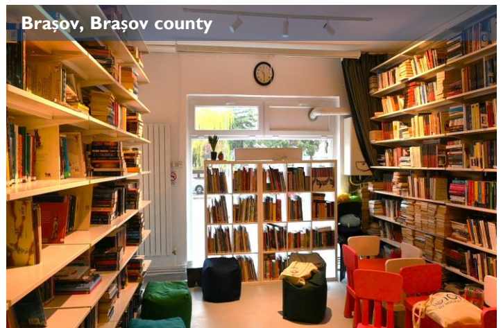
Brașov, Brașov county